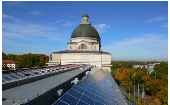
PC05 Trina Solar modules.

Tradition and modernity go hand in hand in Bavaria – and that also goes for the energy system and supply in this economically-strong Southeastern German state. The Bavarian State Chancellery, official residence of Horst Seehofer, Prime Minister of the State of Bavaria, is supplied with solar energy from a PV array. Covering a roof area of 800 square metres, the array generates 70 MWh of solar electricity, which is used by the State Chancellery directly. OneSolar International, a project developer for PV systems and wholesaler for solar products, installed the PV system on the heritage-protected building, using, 296 TSM-